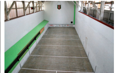
Spot the tambour: the courts at La Bastide-Clairence (left) and Bayonne (above)