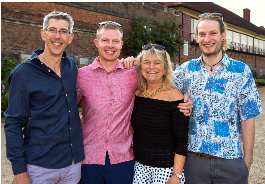
A last group hug for the best team in the business

The club's board and its members, as well as my fellow Professional team, have been so supportive of my Real Tennis endeavours and this support - together with the financial help of the Pro Development Fund - has enabled me to move from a low single figure handicap into the realm of the world's elite players. I have held a career-high World Ranking of