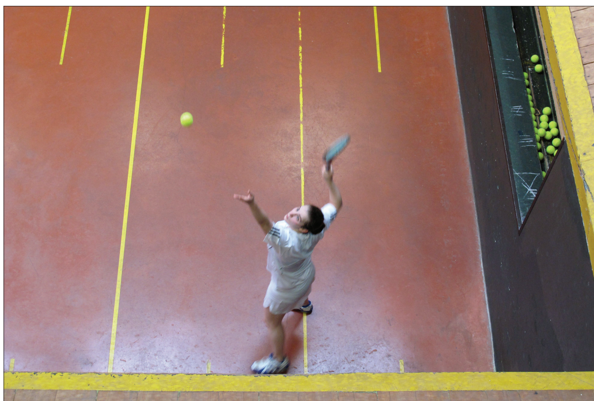
Photograph © Frederika Adam – see also page 2