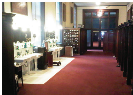
The changing room at Philadelphia

A good shower is one of life's pleasures, and these were a delight. The shower head was at least 12 inches across and the cubicle must have been 5ft across. The only disconcerting thing was that the showers are on full display from the bar (in the changing rooms) and there's no curtain!