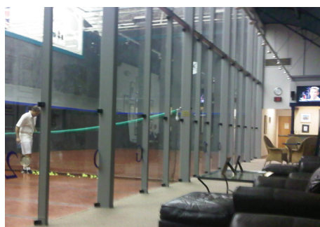
Princes Court, Washington DC

One down, five to go; and my car was upgraded to a Merc.