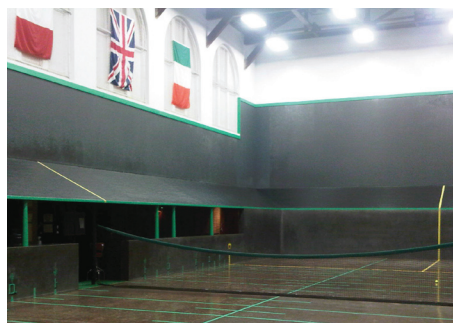
The court at Tuxedo Park

The court is airy and bright. My opponent was a former professional Jai alai player from the Basque region of Spain (think squash on a court 180ft long using baskets strapped to your